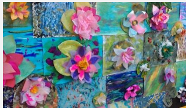
Model lilies created by our talented staff!