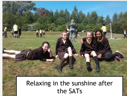
Relaxing in the sunshine after the SATs

I would like to say a big well done to all of our Year 6s for their efforts this week in their Key Stage 2 SATs. They can all be very proud; their attitude and determination has been fantastic! They are a credit to Midsomer Norton Primary School. Thursday 25 th May, we have a Celebratory Post SATS breakfast. Please look out for the letter sent home today!